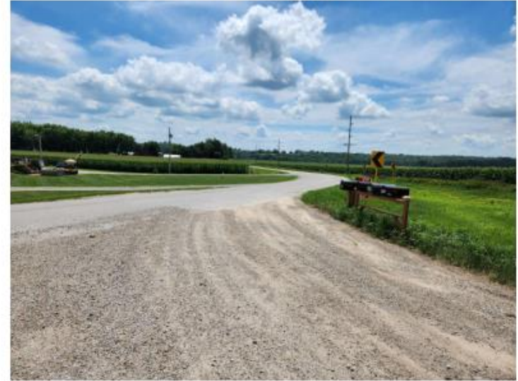
240 th to the East